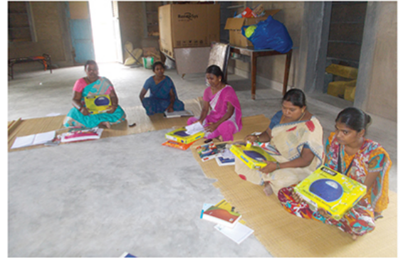
All the CHWs were provided by a stethoscope, a sphygmomanometer and a weighing machine.