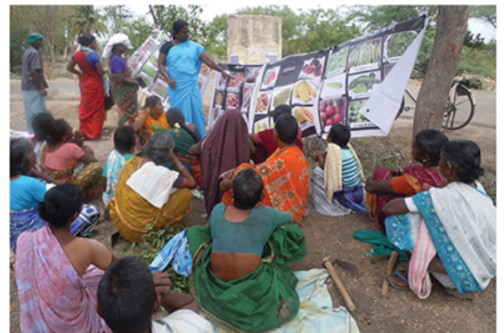
Awareness sessions on nutrition conducted at Kannapadi village MNREGA work site, after working hours.